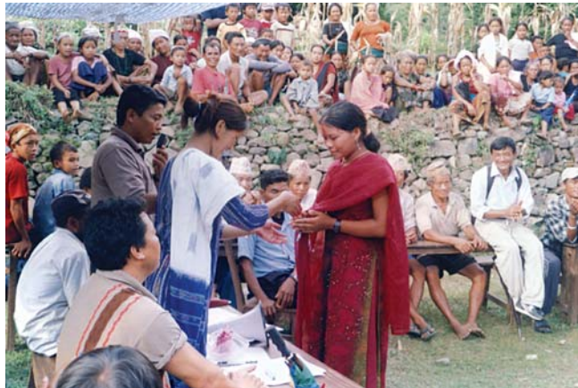
A young Chepang woman is selected as a Joint Secretary of District NCA in Gorkha in 2007.

In the Chepang story, one factor that stands out is the innovation in programme design and partnership modalities based on the changing needs of the excluded group. It was essential for the Chepang to have their own national organisation when they began advocating for their rights to the government or sought support at national level. But its foundation had to start at the grassroots level. Hence NCA is often referred as one of the few organisations which has outreach to villages.