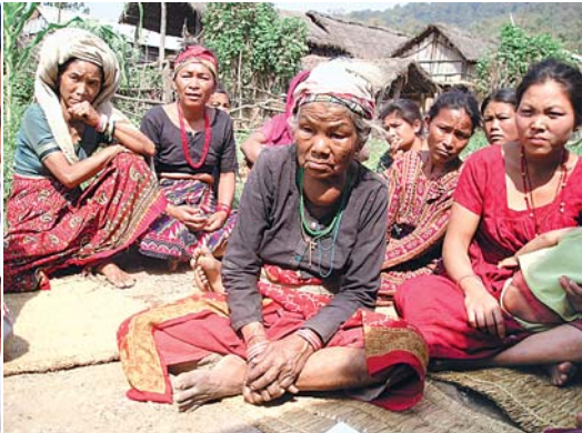
A Chepang woman in Makwanpur shares her struggle to get old age pension after obtaining citizenship certificate.