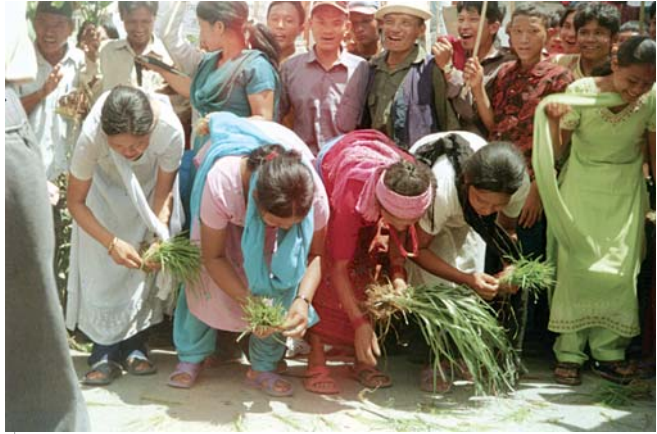
Unique demonstration on Land rights in Gorkha in 2006.

Former Country Director of SNV during PCDP 1 and interim Country Director of SNV in 2007, recalls, "There was definitely a 'rights' element to our understanding of empowerment at the beginning. We had a series of debates within the organisations about rights. But we decided not to adopt RBA at that time. But, the analytical framework