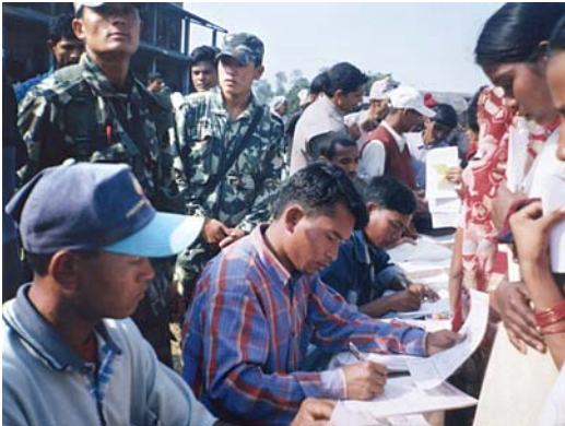
Chepang activists support application writing at citizenship distribution camp in Chitwan in 2005.