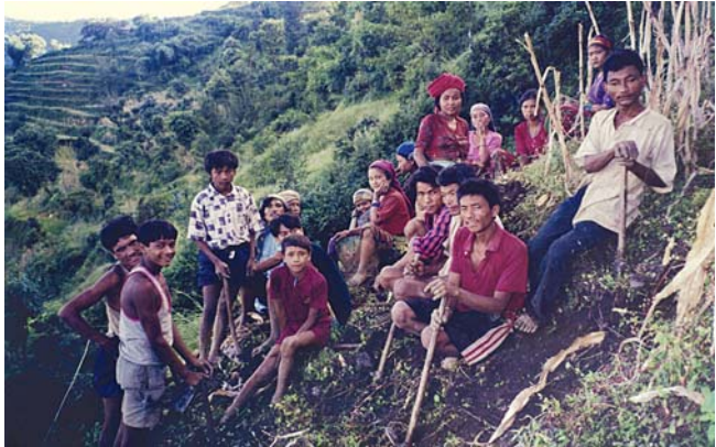
Farming a slope in Chitwan in 1990s

The Chepang is an indigenous people living in the upper hills of the central region of Nepal. The total population exceeds 55,000, located across Chitwan, Dhading, Gorkha, Makwanpur, Lamjung and Tanahun districts. They are categorized as a highly marginalised indigenous nationality by the National